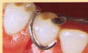
Cast metal clasp