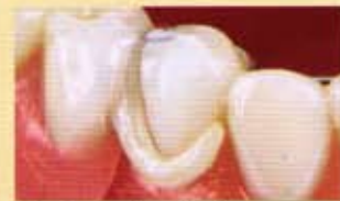
Tooth colored clasp