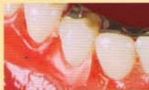
Tissue colored clasp

A tooth clasp or precision attachment is used to hold a partial denture in place. Your specific options may differ due to your unique dental needs. There may be several different options to choose from.