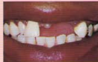
Before: The patient was missing several front and back teeth. A removable partial denture was the most economical option.

Just like your hair is uniquely yours, every mouth is also different. When you visit your dentist for a consultation on a partial denture, impressions will be taken to produce study models of your mouth. Your dentist and the laboratory technician will examine your case thoroughly and design a partial denture that will be comfortable, esthetic, and long lasting. So if you need to fill that gap, ask your dentist which type of partial denture will be best for you.