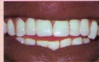
After: The missing teeth were replaced using a comfortable and esthetic metal-free partial denture.